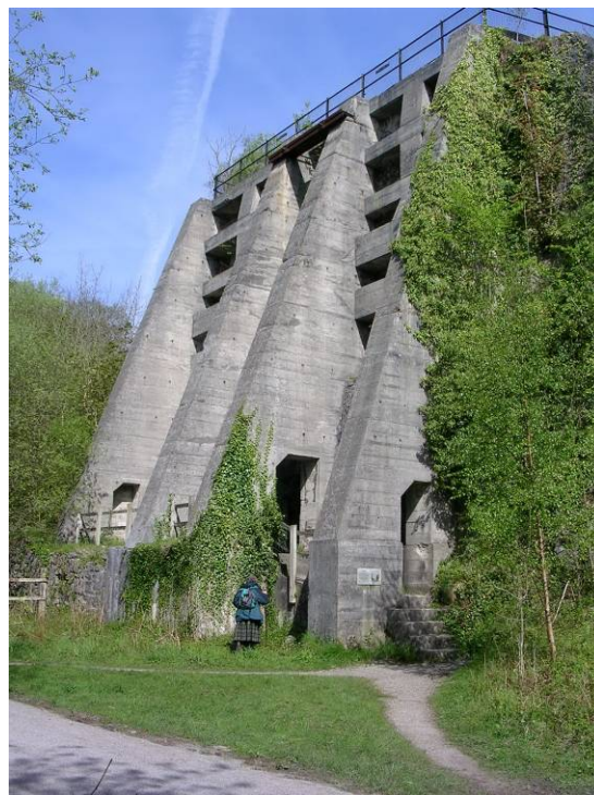
An old lime kiln (Activity 4)