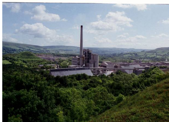
The use of limestone on an industrial scale: Hope Valley Cement Works (Activity 4)

Extension 2: How could you tell where most of the \text{CO}_2 came from? Show heating without \text{CaCO}_3 (solid) to demonstrate that the Bunsen flame itself also produces \text{CO}_2 (gas).